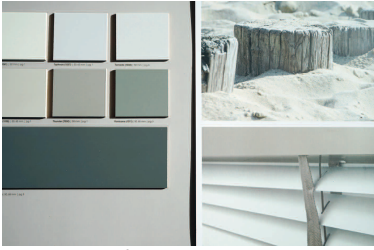
Wooden painted finishes