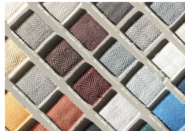
Blue Linens by Designers Guild

These particular blinds come in a myriad of colours ranging from hot and spicy reds to heathery purples, silvers, golds and finally down to soft sandy creams. There are different finishes such as hammered, frosted, matt or polished. Which can definitely add a subtle yet contemporary twist to your window treatments.