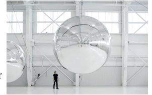
Prototype for a Nonfunctional Satellite (Design 4; Build 4), 2013, Mixed media, Installation view, Courtesy of Trevor Paglen Studio

Into the Unknown brings together artists, designers, filmmakers, SFX specialists, musicians and writers all testing the boundaries of reality through some of the most experimental works of all time. Curated by Swiss historian and writer Patrick Gyger, this festival-style exhibition explores the classic narratives of Science Fiction and presents them from a new, global perspective.